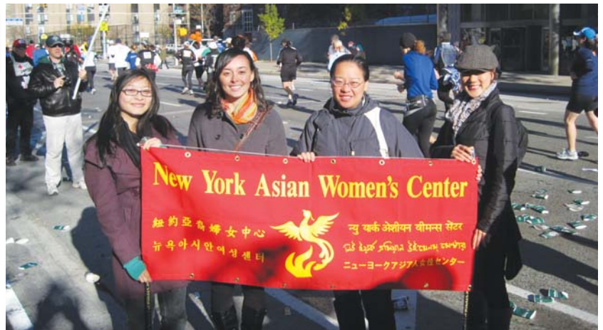
NYAWC staff and volunteers support the runners from the Cheering Station at mile 19.