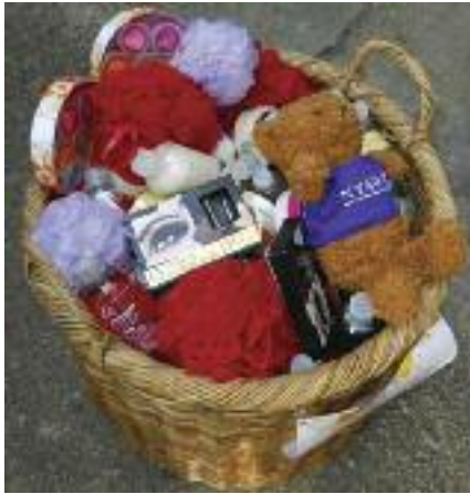
The Body Shop Gift Basket

The Body Shop at 2159 Broadway donated an assortment of beauty products to women in our shelters in celebration of Mother's Day.