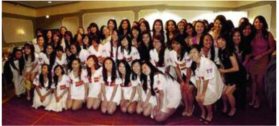
Sorority Sisters from Sigma Psi Zeta

The University of Maryland's Sigma Psi Zeta Sorority held its SPEAK Charity Dinner on April 12, benefitting NYAWC.