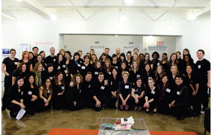
Reveal volunteers pampered the truly deserving women with head to toe makeovers that included stunning hairstyles and new outfits.