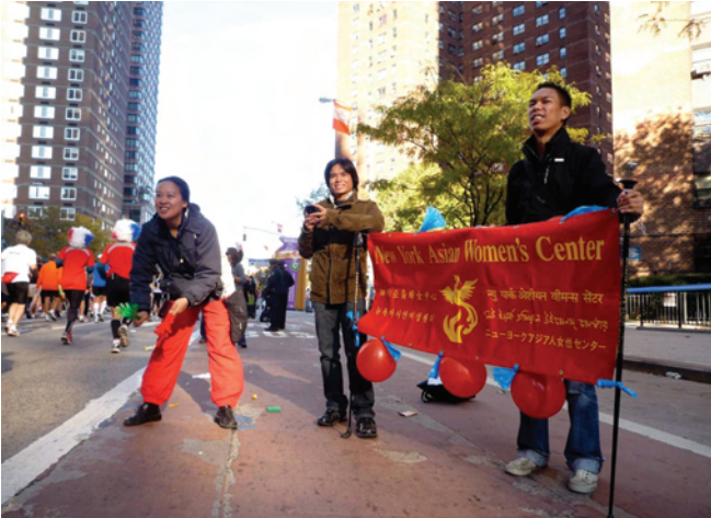
Cheering on the runners.

In honor of Valentine's Day, NYAWC clients celebrated the beauty in themselves with the help of Reveal. On February 11, 2012, Reveal volunteers pampered the women by providing head to toe makeovers—from stunning hairstyles and to shiny shoes. In addition to a souvenir of new outfits, the women walked away with fond memories of a relaxing afternoon they truly deserved.