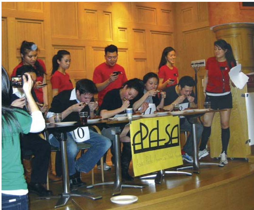
Contestants at the APALSA eating contest

In an effort to end violence against women and girls in February, the V-Day Campaign's annual benefit events supported NYAWC's work. As a part of the V-Day Campaign, Hunter College's V-Day Team put on performances of The Vagina Monologues and CABARET: "If my Vagina Could Talk...", which raised over $1,860 for NYAWC. The agency was also selected by the Fourth Universalist Society as the recipient of its fundraiser. Proceeds from the Society's performance of The Vagina Monologues totaled around $2,000 for NYAWC.