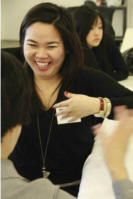
Reveal NYC Volunteer laughing and feeling the joy of giving a survivor a brand new look.

February 16, 2013 - - "Joy," "transformative," "encouraging," "beautiful," "renewal," "love," and "peace" were all words used to describe the 2013 Valentine's Day Makeover Event for survivors of domestic violence and human trafficking held by Reveal NYC. The