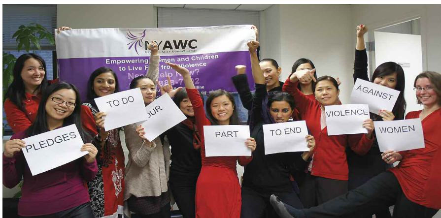
NYAWC staff and volunteers taking the One Billion Rising pledge